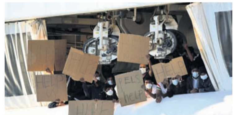
Migrants hold banners asking for help, from a deck of the Norway-flagged Geo Barents ship operated by Doctors Without Borders, in Catania's port, Sicily, southern Italy, Monday, Oct. 7, 2022. The Geo Barents has been allowed Sunday to disembark 357 migrant that Italian authorities defined as "vulnerable people" and minors, while leaving another 215 people that were declared non-vulnerable blocked on board.